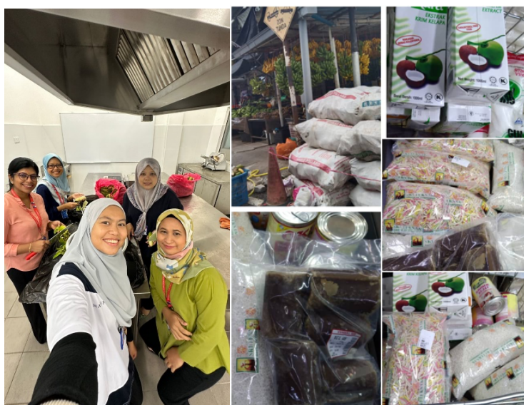
Ingredient preparation for “bubur manis”

This event took place on April 2, 2024 (Tuesday) and began with ingredient preparation at 8:00 a.m.