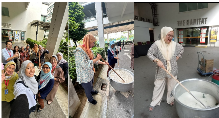
Faculty members gathered in front of Habitat Humanity Building, getting ready to distribute the “Bubur Manis”

We extend our heartfelt gratitude to all the staff and committee members from FOM and CPU who contributed to the success of this event.