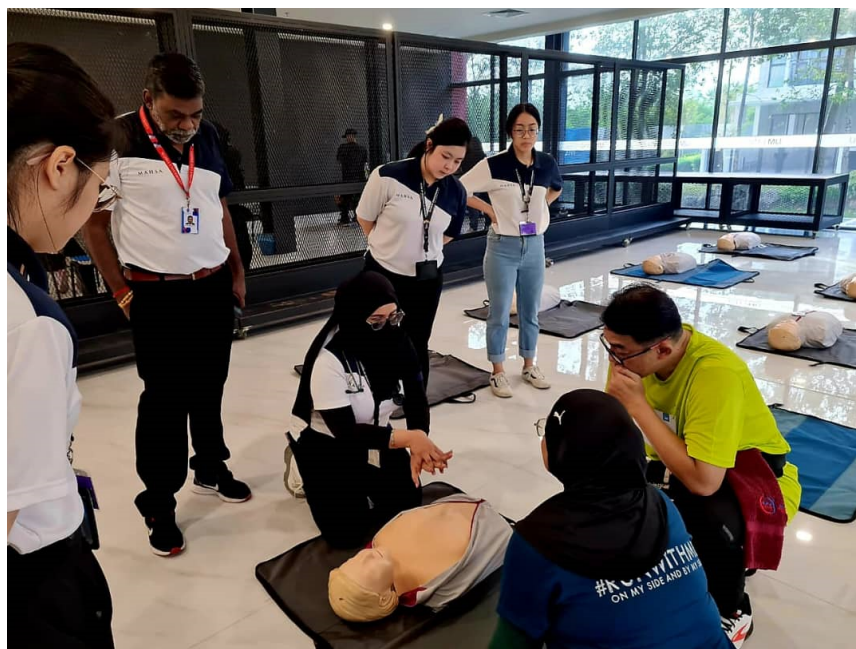
Demonstration of life-saving CPR

Volunteering as a CPR instructor at the Persiaran Rimbayu medical camp was a deeply rewarding experience. Seeing participants gain confidence in their ability to perform CPR and knowing that these skills could one day save lives was incredibly fulfilling. The gratitude expressed by the community was heartfelt, and it underscored the importance of such initiatives. This experience also reinforced the significant impact of grassroots health movements. When a community comes together to share knowledge and resources, it creates a network of support that enhances the overall well-being of its members. The Rimbayu Community Project is a shining example of how local initiatives can drive meaningful change.